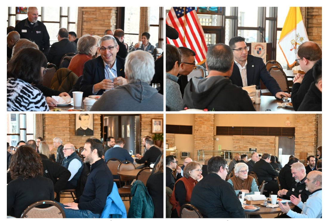
Bridging Communities Over Bagels

On February 04, at Bagels with Lux, meaningful conversations, new connections, and a shared spirit of dialogue took place between the Jewish community and the seminary's faculty, staff, and seminarians. Over bagels, lox, and lively roundtable discussions, they explored faith, traditions, and the values that unite us. The energy in the room was implausible, with participants expressing their joy and gratitude for the opportunity to engage in deep and thoughtful conversations with members of a different community. Moments like these are what The Lux Center is all about—building bridges, fostering understanding, and creating lasting relationships.