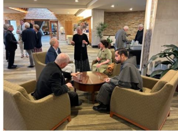
Faculty Council Dinner

On May 8, the Faculty Council held its last meeting of the school year. To celebrate the completion of the semester the Faculty Council held a special dinner to recognize their hard work during the past academic year!